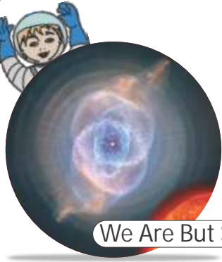
We Are But Star Dust