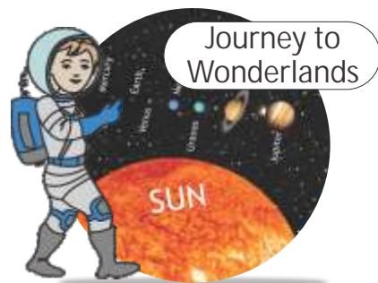
Journey to Wonderlands