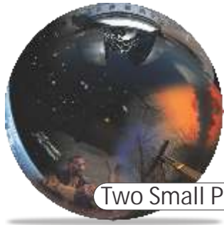
Two Small Pieces of Glass

(Working and Contributions of Telescopes)