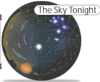
The Sky Tonight