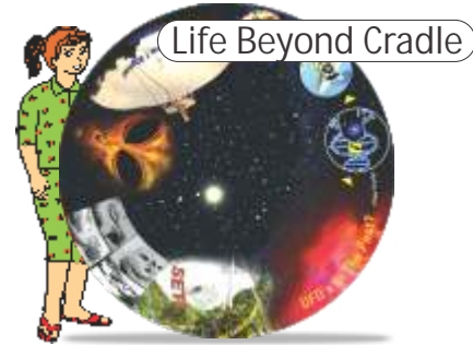
Life Beyond Cradle