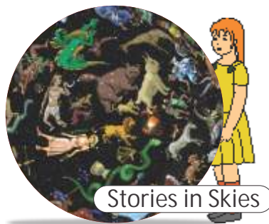
Stories in Skies